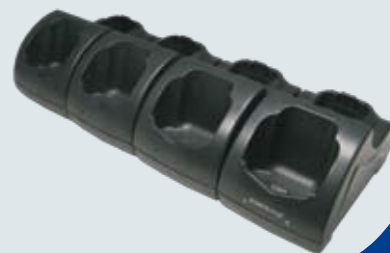
Multiple Cradle (Ethernet)

Please refer to user manual available at www.mobile.datalogic.com/manuals for information on product use limitation. For more information see: www.mobile.datalogic.com/datalogicJet