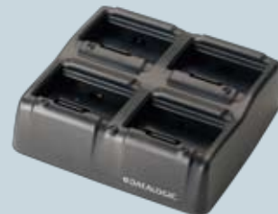
Single Cradle and Multiple Battery Charger